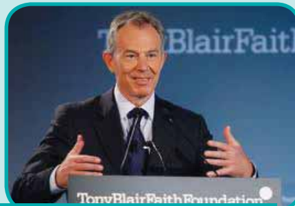
Video Conference in progress with Mr. Tony Blair, former P.M., U.K.