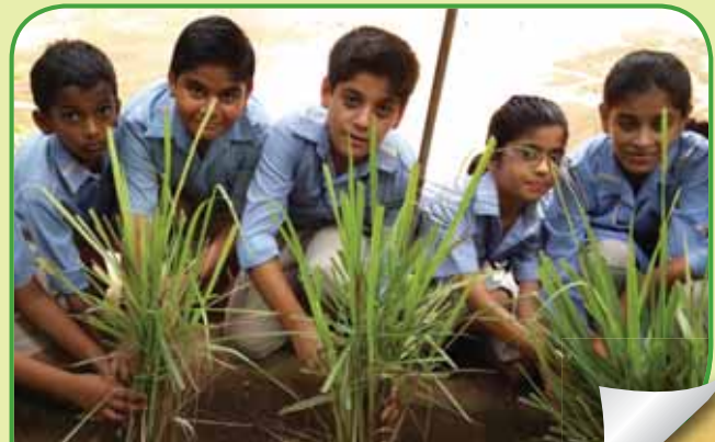
Enthusiastic Students working for a healthy environment